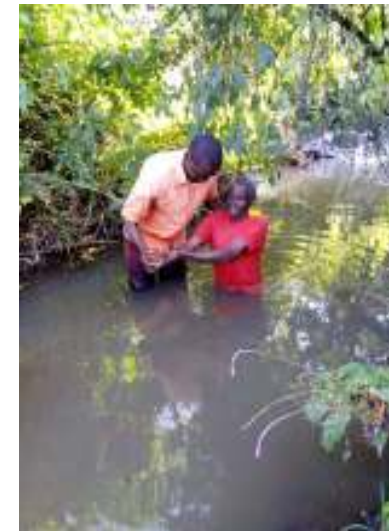
One of the baptisms at Ogiek

Of the church at Siagon, Benard wrote, "This congregation is big and has been meeting in someone's school building, but were told to look for a place of worship and are requesting brothers' help in putting up a temporary church building."