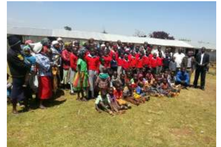
The church which meets at Siagon must now find another place to worship and hopes to erect a temporary building